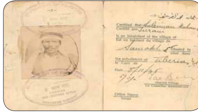
palestinian ID card from 1935 confirming residency of a village in the district of Tiberias