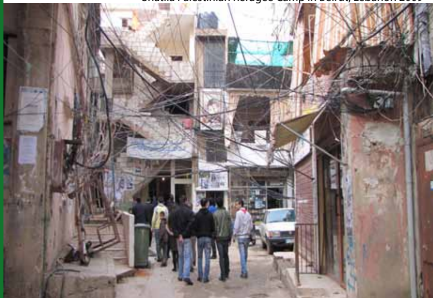
Shatila Palestinian Refugee Camp in Beirut, Lebanon 2009

After all if Israel's ideology is to materialize, the ingathering of Jews, then it has to accommodate the other 9 million Jews. The problem is not resource and space, the problem is Israel's strong reluctance in allowing Palestinians to exercise their human rights, especially their right of return. The problem is Israel's unimpeded racial discriminating against the Palestinians.