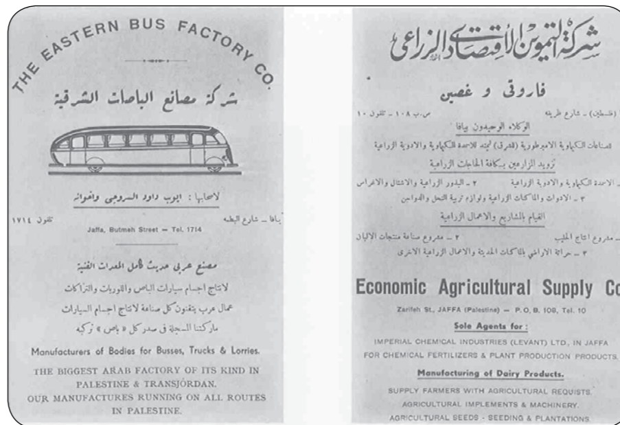
Thriving manufacturing industry in Palestine: The Eastern Bus Manufacturing Co. & Economic Agricultural Supply Co. Early 1930